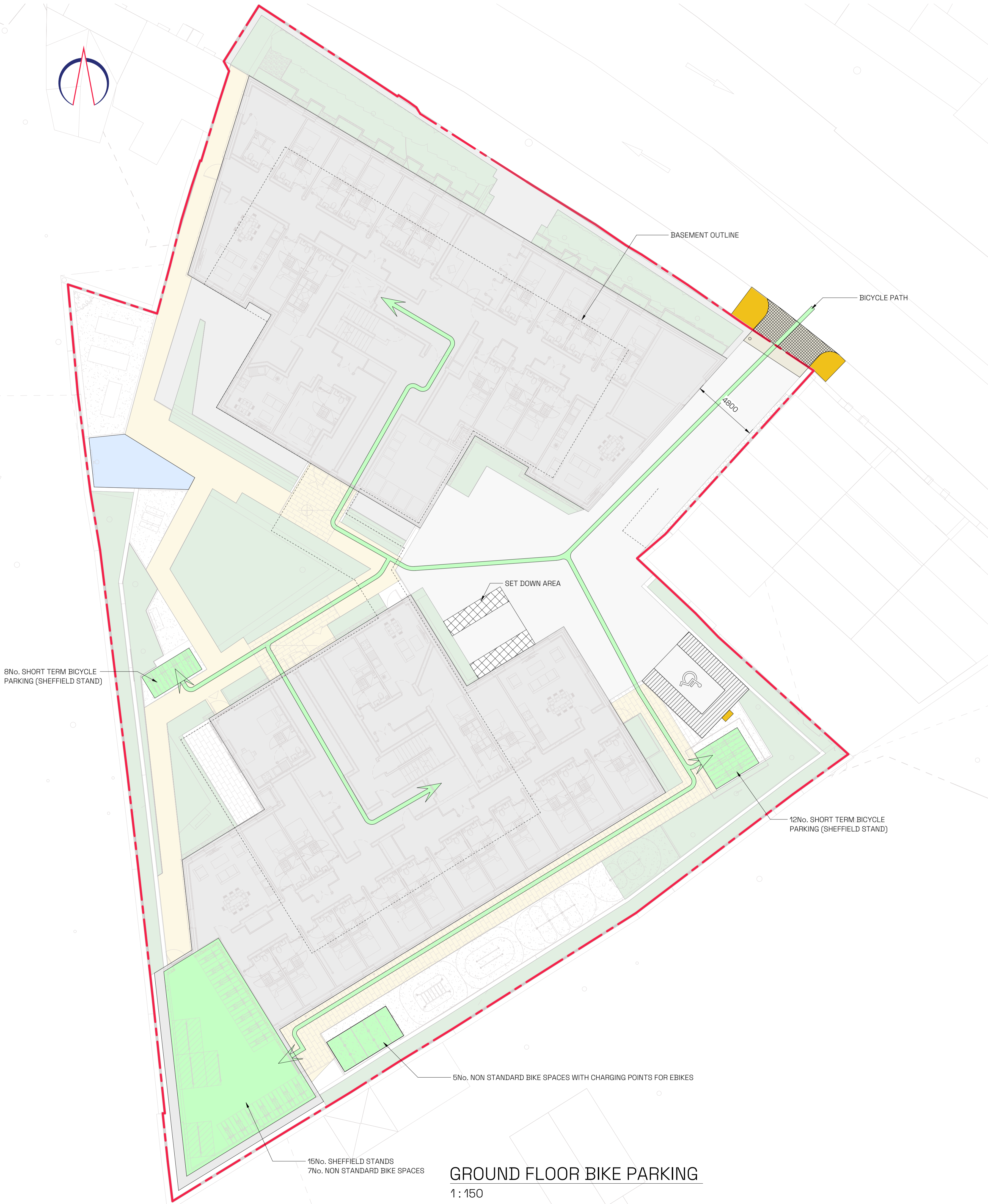
GROUND FLOOR BIKE PARKING 1:150